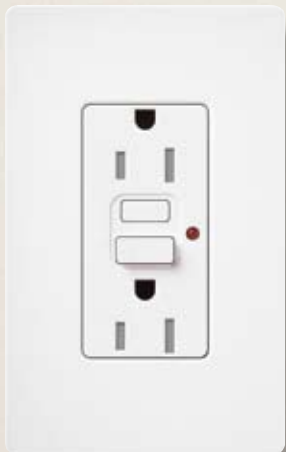
Tamper resistant GFCI receptacle