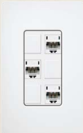
Customizable 6-port frame