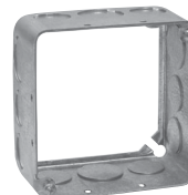
TP443 (2 1/8" Deep)