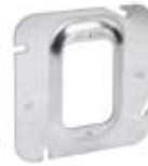
TP574-TP582, TP529, TP531