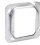
TP584, TP586, TP589, TP593, TP541, TP543