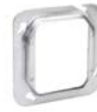
TP584, TP586, TP589, TP593, TP541, TP543