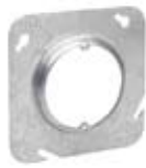
TP569, TP570, TP571 TP573, TP575