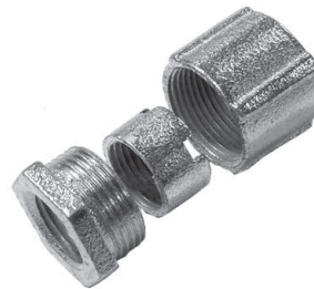
TPC - 50