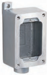
SWB-1, 2, 3