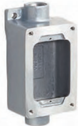
SWB-4, 5, 6