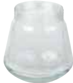
500 W Max. Lamp Size PS-35