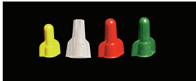
3M™ Electrical Spring and Grounding Connectors

The quick-spin, wing-torque design of Electrical Spring and Grounding Connectors 312, 412 and 512 is easy on your fingers. The day's last connection will feel almost as good as the first. Generous expansion room accommodates a wide range of solid or stranded wire. Use the 312 (yellow) connector for wire combinations from 3 #20 to 3 #12 AWG, the 412 (tan) connector for 2 #20 to 3 #10 AWG and the 512 (red) connector for 2 #18 to 5 #12 AWG. The 512G (green) is used for grounding connections.