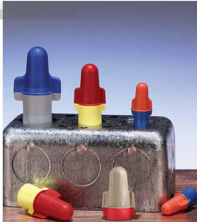
3M™ Performance Plus Wire Connectors